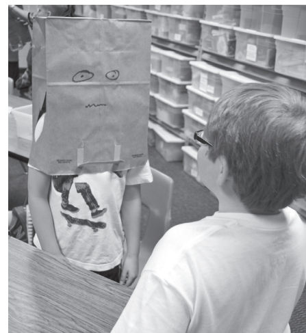
Third grade students participate in a classroom exercise that focuses on listening during family discussions.

Let's work together to make our communications with school, home, child and each other to be more positive. That way, everybody wins, especially the kids!